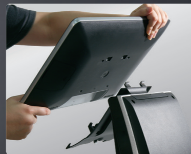
The display can be easily removed for quick and efficient maintenance.