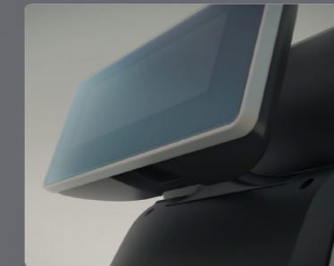
The integrated customer display can be turned and tilted for the best viewing angle.