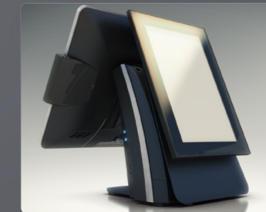
11.6inch second display with bracket