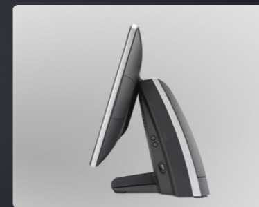
The small footprint helps save space and improves flexibility for the design in the store.