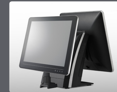
15inch second display (pole type)