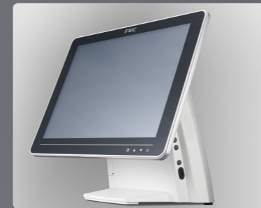
Standard Colors: Black + Silver; Black + Red; White + Silver