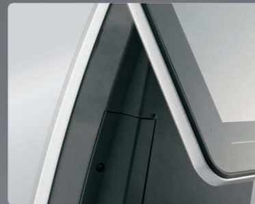
Ventless design keeps dust and debris out of the system.