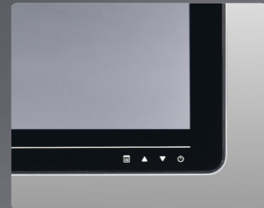
OSD Controls: Display brightness, display power on/off